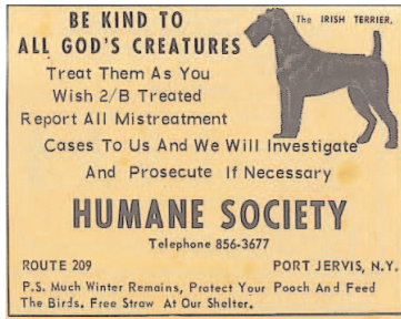
Newspaper Ad in the mid-1960s