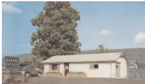
Our shelter circa 1960

Our shelter had the most humble of beginnings on a small piece of land on Big Pond Road in Huguenot. We moved to our current location in the early 1960s and have remained much the same, only larger. We believe the founding members would be pleased that their legacy is sound and looking ever forward to the future.