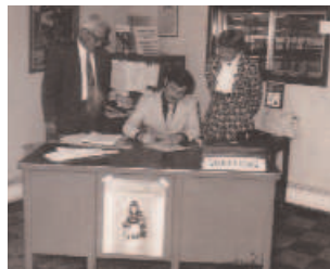
Office Business circa 1965

A prayer from the cover of the 10th Anniversary Report - 1969