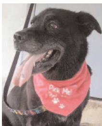
Serifina 8 years old

Here are some Oldies But Goodies who have already been adopted or are waiting just for you to fall in love with them. If you have any worries about adopting an older pet, just speak to our staff about your concerns. They will help you make the right decision for the pet and for yourself!