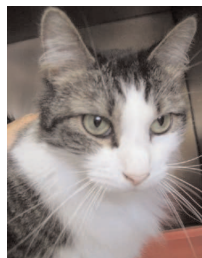
Tiger 6 years old