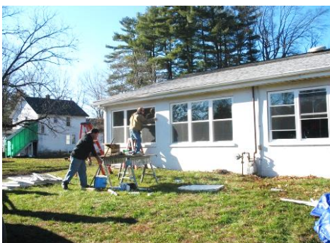
Heals Glass replacing windows in a kennel building.

Lost & homeless animals put their trust in us every single day. They rely on complete strangers to help them find their way home, heal their wounds, provide them with food and shelter, and show them kindness during their greatest time of need. One of the many wonderful qualities that animals possess is the ability to forgive even after being abandoned, neglected and abused. Humans on the other hand, have a much more difficult time overcoming the feeling of betrayal. So it is my hope that our actions speak for themselves, proving we have the best of intentions and members of the community will take a chance on us, so we can continue our essential mission of saving animals.